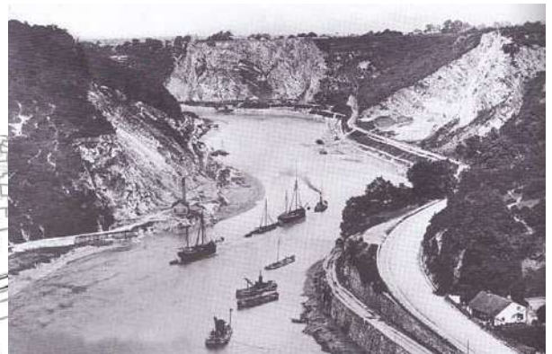
View of Bridge Valley Road-1913-before the Portway existed