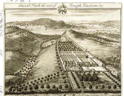
Old Sneed Park: Johannes Kip, 1768