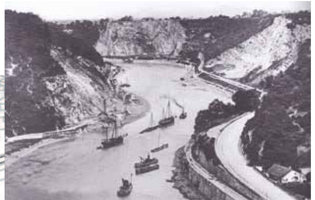
View of Bridge Valley Road-1913-before the Portway existed