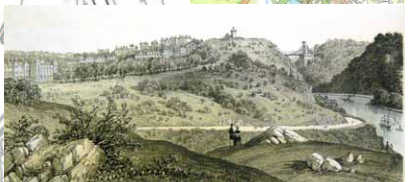
View of Bridge Valley Road, 1860