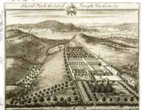
Old Sneed Park: Johannes Kip, 1768